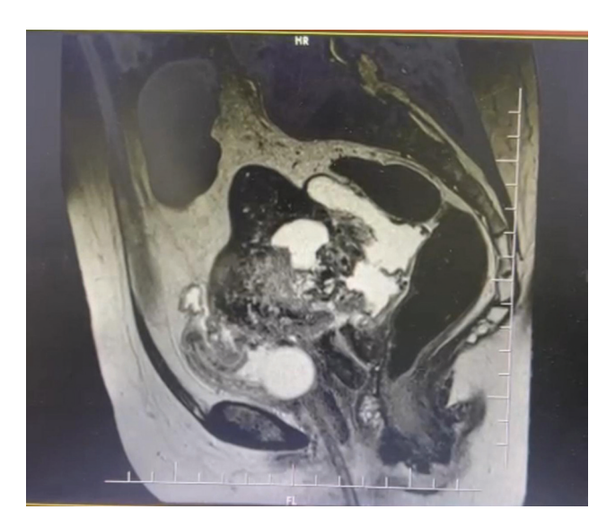
Fig. 1 Magnetic resonance imaging showing pelvic mass infiltrating the bladder.

Microscopy showed epithelioid tumor cell nests with necrosis and calcification with atypical features and a 4 mitosis/10 hpf (high power field) was noted ( \succ Fig. 2). Tumor cells were seen involving the adjacent fallopian tube and ovary. The International Federation of Gynecology and Obstetrics (FIGO) stage II was reported as the tumor extends to other genital organs. IHC was asked for confirmation. The patient came to us with an IHC report for further management. IHC markers of cytokeratin (CK) 8/18, P63, and inhibin were positive. SALL4, desmin, and GATA3 were negative. K_i -67 was 20% ( \succ Fig. 3). After seeing the histopathological report, \beta human chorionic gonadotropin ( \beta -hCG) was done and was 4.47 mIU/mL.