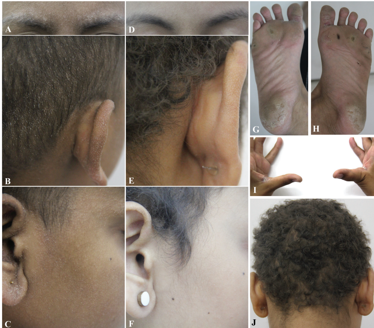
Fig. 1 Skin-colored to whitish, pin-point, spiny follicular hyperkeratotic papules over the (A) eyebrows, (B) scalp, and (C) ears; (D, E, F) Complete clearance of rash following sorafenib dose reduction and topical keratolytic application; (G, H) Hyperkeratotic hand-foot skin reaction involving the pressure points of soles; (I) Fissured scaly plaques over first finger web space bilaterally; (J) Regrowth of curly hair following chemotherapy induced anagen effluvium.

Six months later, on examination, there were no signs of SFH (►Fig. 1D–F). However, she complained of tender yellowish thickening of skin over pressure points of soles (►Fig. 1G, H), fissured scaly plaques over first finger web space bilaterally (►Fig. 1I), multiple acquired melanocytic